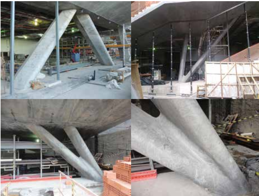
Fig. 6: Actual inclined columns in the building exhibit the high-quality finishes required of the exposed structural and architectural elements