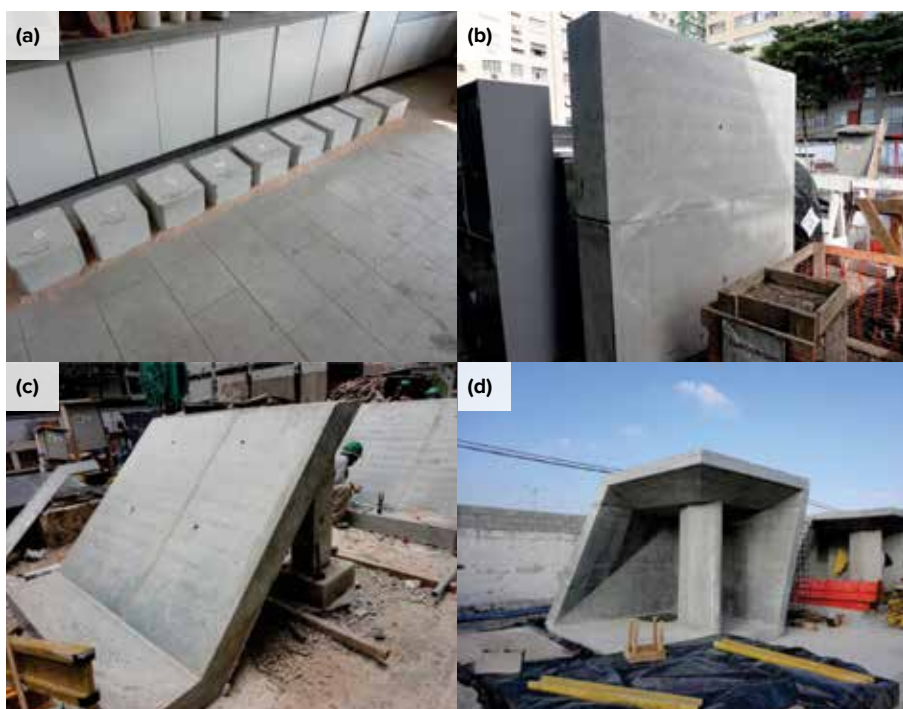
Fig. 3: Various simulations and mockups used to establish materials and methods incorporated in the building construction: (a) cubic specimens in the laboratory of the concrete supplier, October 2011; (b) vertical wall cast at the jobsite, February 2012; (c) inclined wall (45 degrees) cast at the jobsite, February 2012; and (d) full-scale mockup cast in the courtyard of the concrete supplier's plant, July 2012

As shown in Fig. 5, the finishes are very good. Bugholes are minimal, indicating that the completed surfaces would satisfy Class 1 requirements per CIB Report No. 24. Also, none of the mockups exhibited any type of cracking. The procedures were therefore deemed suitable for actual placements.