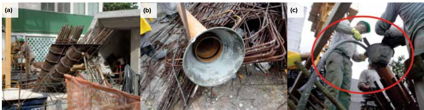
Fig. 4: Casting the inclined column mockup helped in the evaluation of various factors: (a) metal forms and inclined reinforcement projected from a previously cast base joint; (b) a drop tube was used to deliver concrete from the concrete bucket to the base of the column form; and (c) a bottomless pail acted as a funnel and reservoir for concrete, allowing a vibrator to be inserted into the drop tube without overflow