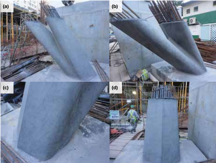
Fig. 5: Mockup finishes: (a) sides; (b) sides and lower region at joint; (c) detail at base and joint; and (d) overview of upper inclined region